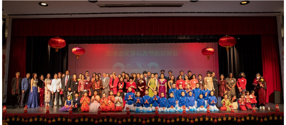
HCCS 2023 Spring Festival Gala Group Photo.